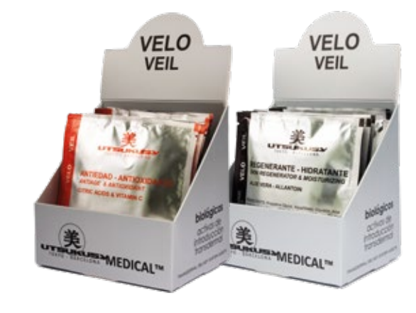
ANTI AGE VEIL ANTI AGE AND ANTIOXIDANT Composition: Citric acid.

It allows an excellent skin permeability and penetration of active substances into the deeper layers of the skin. 10 unit box. CODE ep3